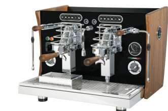
Wood Limited Edition Version