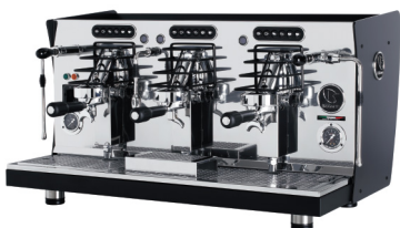
Standard 3 GR Version