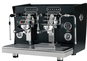
Standard 2 GR Version / LED Version